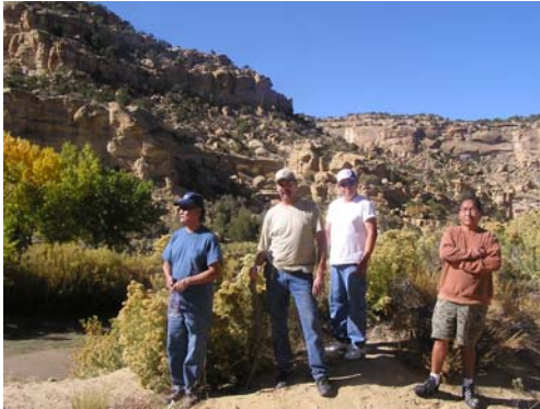
Greetings to all from the Land of Enchantment.

We have come to the end of another session of the Overcomer's and all three men who started have completed the program. We wish to convey our thanks to all who have kept us in prayer this session, and ask for continued prayer for the men as they try to put into action that which they learned while with us. We witnessed God working in each of the men in different areas of their lives.