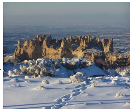
Winter in New Mexico.

let us know. We would be happy to share with anyone who is interested. We will be with the Clinton Frame Mennonite Sunday School class on Sunday morning June 3rd. We are also looking at being at Jefferson Brethren in Bristol on Sunday morning June 10. We will be with our church family in Nappanee on Sunday morning June 17. The rest of our schedule has not been filled yet.