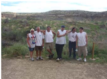
God has also brought us a wonderful couple to be our Home